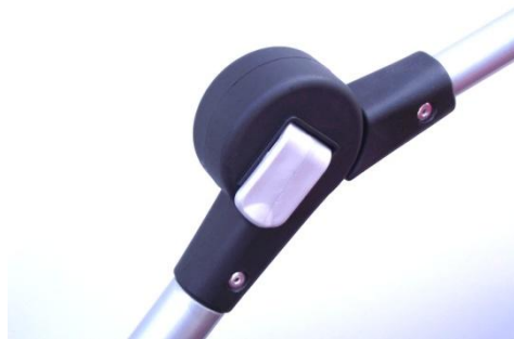
• Adjuster Closed