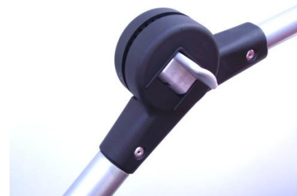
• Adjuster Open